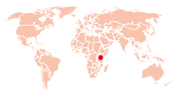
The research featured here is focused on East Africa.

poor countries. Sustainable Development Goal 7 highlights the challenge. 5 Across the developing world, households continue to rely on burning solid biomass like wood for energy – particularly to cook. In East Africa, about 90% of rural and low-income urban families still cook with firewood or charcoal. 6