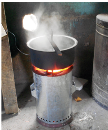
M2 micro-gasifier stove of the Wisdom Innovation Company in Kenya during a water-boiling test conducted at the University of Nairobi in 2016.

Insights described here stem from research carried out between 2013 and 2017 in Kitui County, Kenya, and Kilimanjaro Region, Tanzania, as part of the ProBE project. CDE researchers and partners sought to identify the potentials and limitations of improved, pro-poor biomass energy strategies. Researchers modelled different scenarios of biomass energy production and use, looking for sustainable ways of meeting the projected growth of cooking-energy demand in East Africa through 2030. The results highlight the advantages of using a diverse mix of biomass fuels, optimizing and combining potentials in different settings to cover national/regional energy needs. The ProBE project was conducted within the Swiss Programme for Research on Global Issues for Development (r4d programme; project no. IZ01Z0_146875), funded by the Swiss Agency for Development and Cooperation (SDC) and the Swiss National Science Foundation (SNSF). In addition to CDE, project partners included the Centre for Training and Integrated Research in ASAL Development (CETRAD), Kenya; Quantis, Switzerland; Practical Action Eastern Africa, headquartered in the UK; and the Tanzania Traditional Energy Development Organization (TaTEDO), Tanzania.